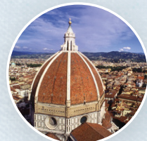
The Dome of Florence Cathedral 📍 Firenze