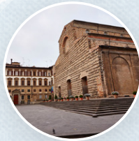
Old Sacristy of San Lorenzo 📍 Firenze