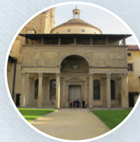
Pazzi Chapel in Santa Croce church 📍 Firenze