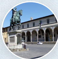
Ospedale degli Innocenti 📍 Firenze