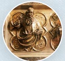
San Jacopo silver altar 📍 Cathedral of San Zeno, Pistoia