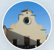
Santo Spirito Basilica 📍 Firenze