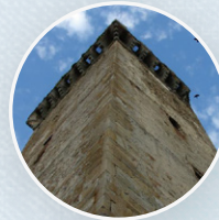
Rocca di Vicopisano 📍 Vicopisano